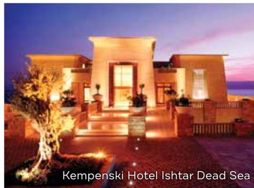
Kempinski Hotel Ishtar Dead Sea