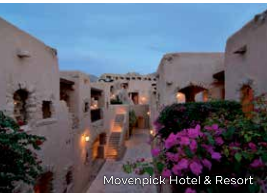
Movenpick Hotel & Resort

Dead Sea therapies are so highly regarded by some EU countries, including Germany and Austria, that long stays in the area are available courtesy of their health insurance plans.