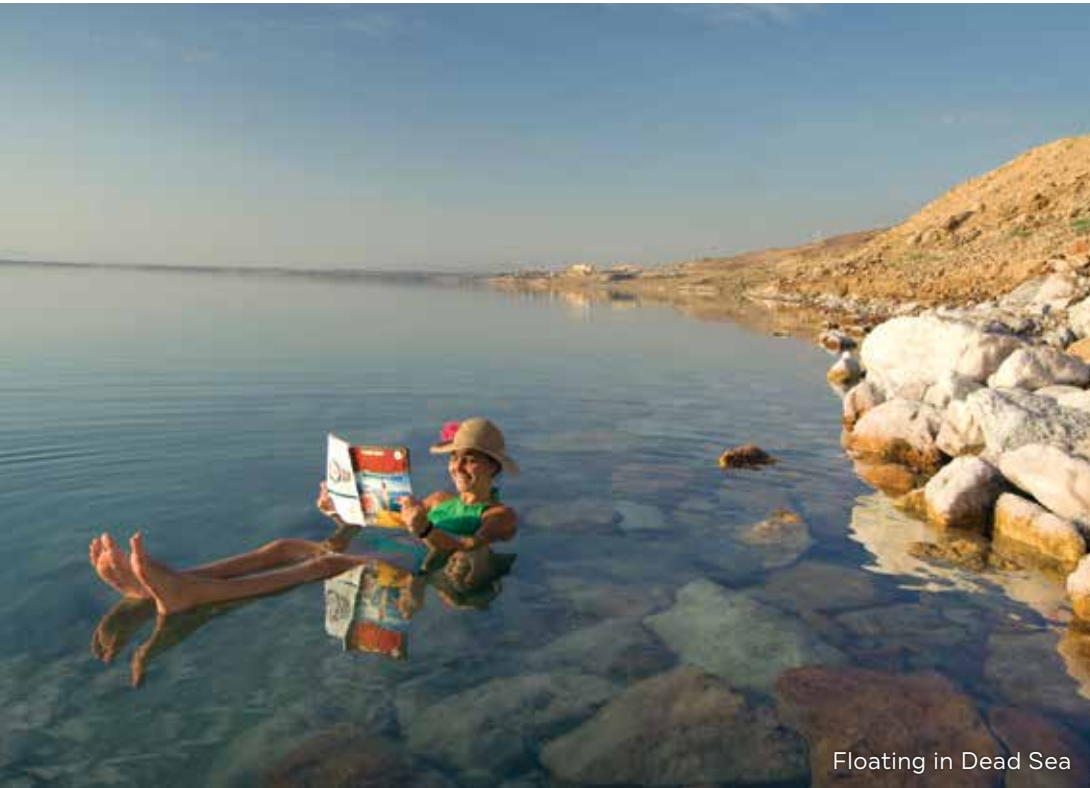
Floating in Dead Sea

Imagine floating in the buoyant, warm, super-salty waters of the Dead Sea, enjoying a relaxing massage, and then delighting in an exquisite meal amidst exotic surroundings. Or, perhaps, walking through stunning scenery, where only the sounds of the birds and the gentle breeze interrupt your thoughts. Imagine immersing yourself in the therapeutic waters of a thermal spring, sleeping under a million stars, or swimming with marine life in a colorful underwater world. Imagine all the wonders it would do for your overall health and peace of mind.