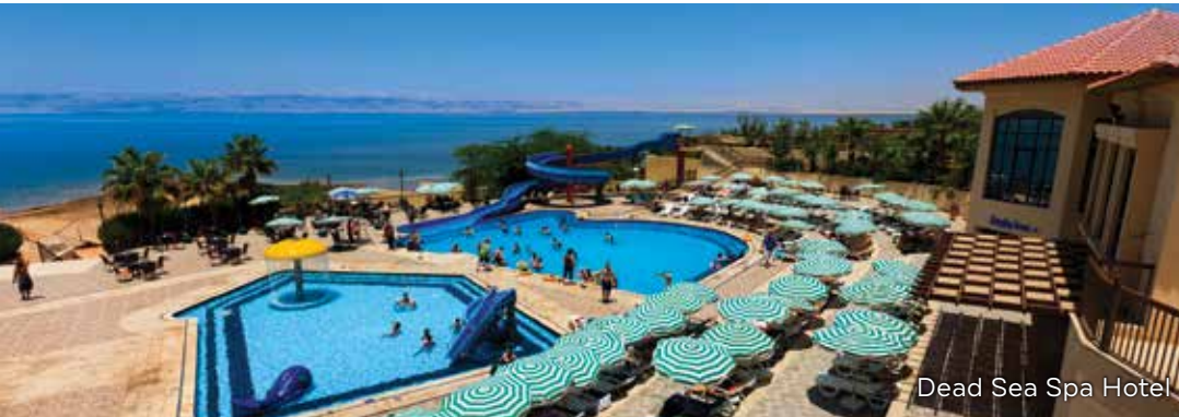
Dead Sea Spa Hotel