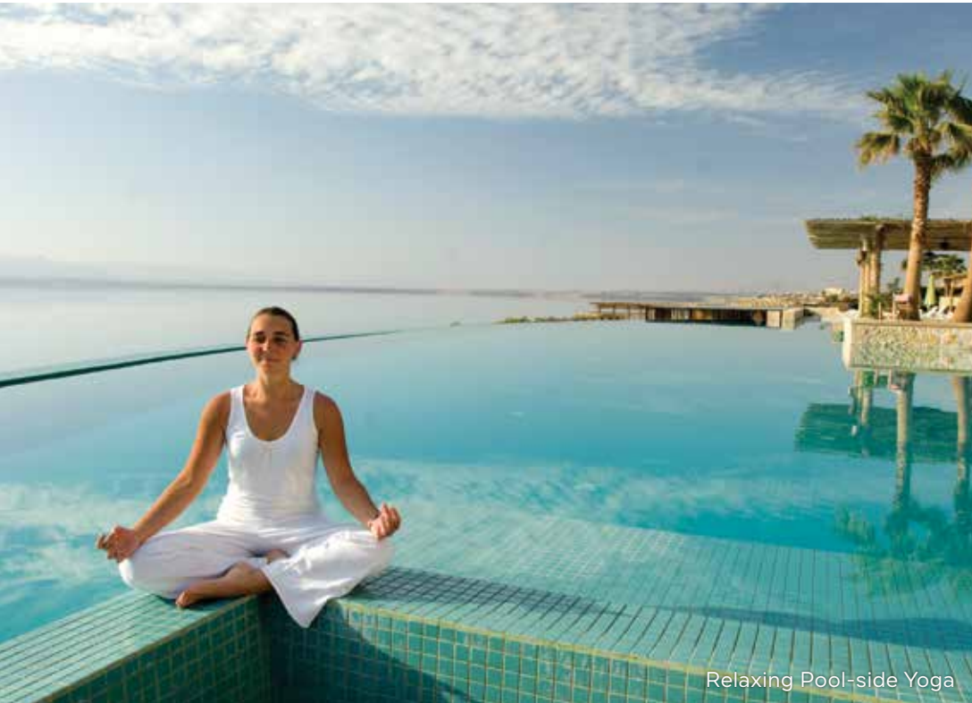
Relaxing Pool-side Yoga

One of the most spectacular natural and spiritual landscapes in the world, the Jordanian eastern coast of the Dead Sea has evolved into a major hub for both the religious and the health & wellness tourism in the region. A series of good roads and excellent hotels, with premier spa and fitness facilities, make this region both accessible and comfortable. Plus, vast archaeological and spiritual discoveries make this spot as enticing to today's international visitors as it was to kings, emperors, traders, prophets and pilgrims in antiquity.