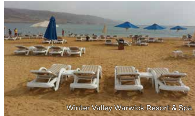
Winter Valley Warwick Resort & Spa