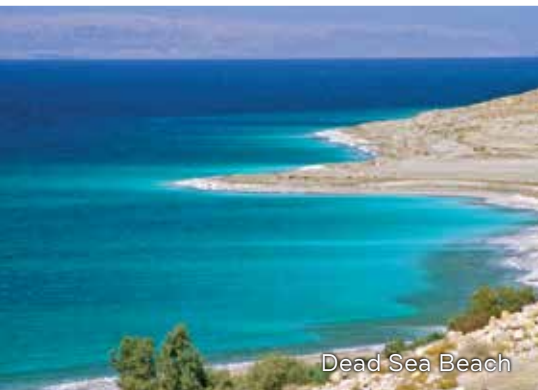
Dead Sea Beach