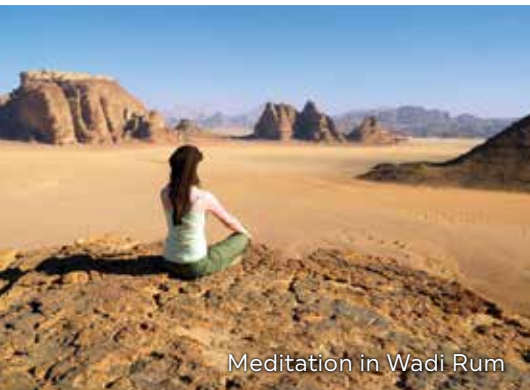
Meditation in Wadi Rum