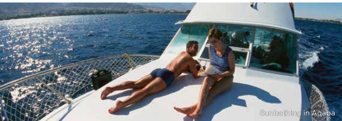
Sunbathing in Aqaba