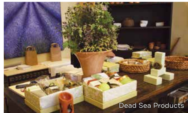
Dead Sea Products

No trip to the Dead Sea is complete without a visit to one of the many outlets that sell the world-famous Dead Sea products. These products are reasonably-priced, of excellent quality, and make great gifts. There are also many shops selling Jordanian handicrafts, rugs, Bedouin jewelry, mosaics, sand bottles, glassware and other locally-made items.