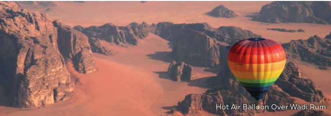
Hot Air Balloon Over Wadi Rum