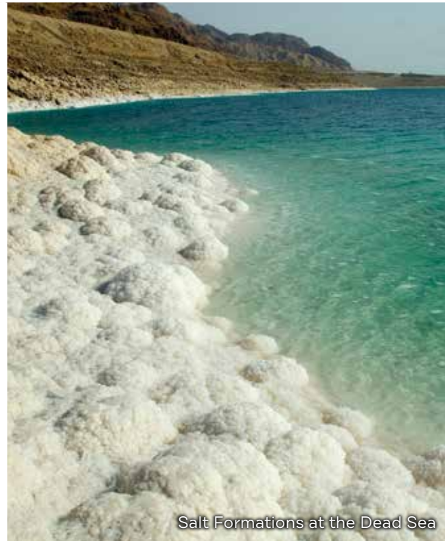
Salt Formations at the Dead Sea