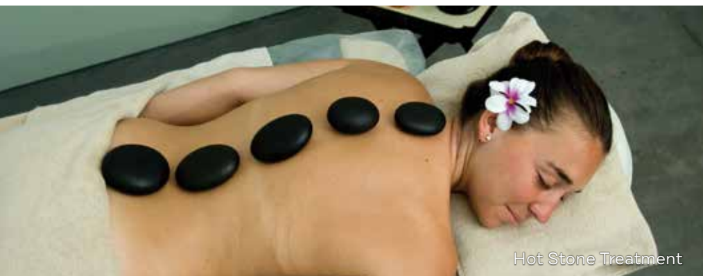
Hot Stone Treatment