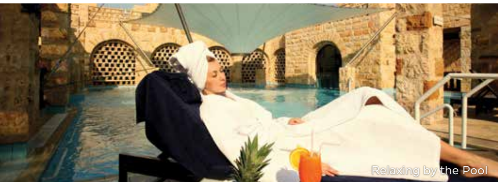
Relaxing by the Pool

Another way to relieve stress at the Dead Sea is by joining one of the newly founded yoga and meditation groups that use the area's natural beauty and serenity to reach unrivaled levels of relaxation. Meditation, a new dimension to the unique Jordanian tourism product catalogue, brings peace to the heart & mind and promotes youth, wellbeing and health.