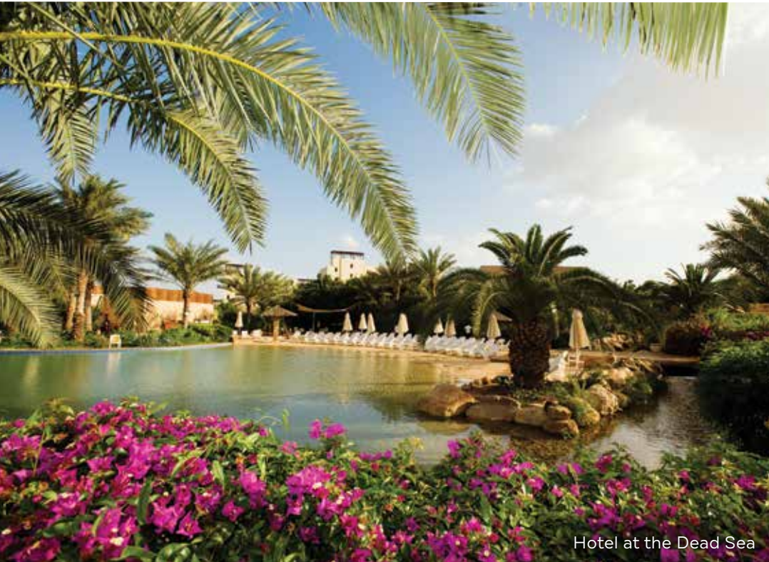
Hotel at the Dead Sea