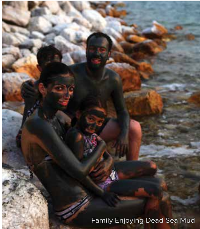
Family Enjoying Dead Sea Mud