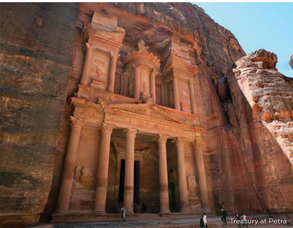
Treasury at Petra

The Treasury is the first of the many wonders that make up Petra. You will need at least 2 to 3 days to really explore everything here.