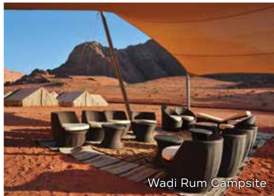
Wadi Rum Campsite