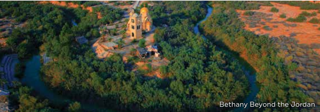
Bethany Beyond the Jordan