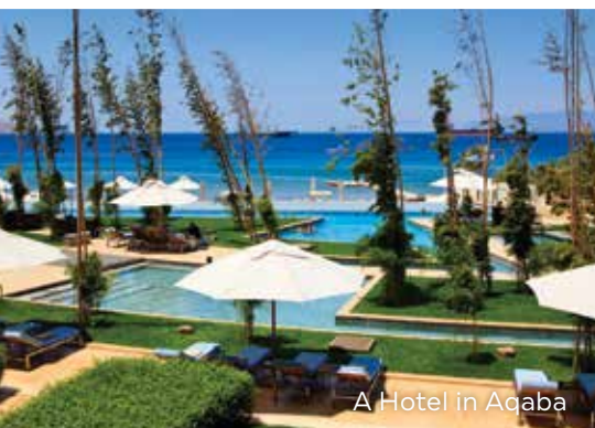
A Hotel in Aqaba