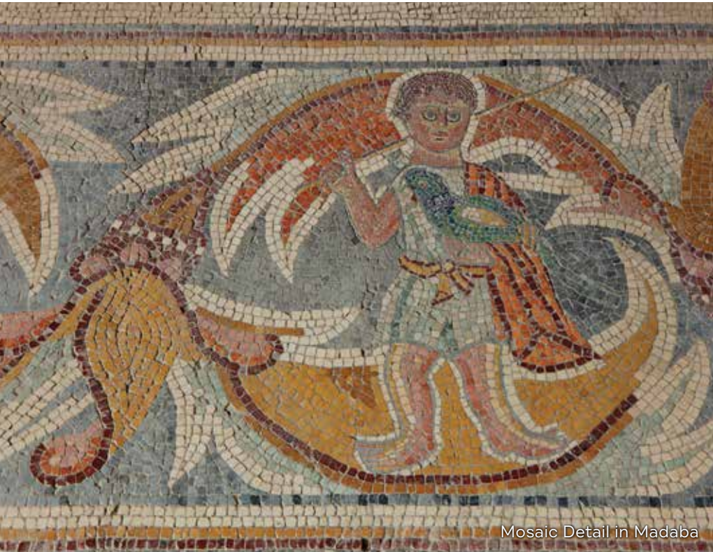
Mosaic Detail in Madaba

Known in the Old Testament as Medeba, Madaba and its hinterlands are located in central Jordan. These lands were featured in narratives related to Moses and the Exodus, David's war against the Moabites, Isaiah's oracle against Moab, and King Mesha of Moab's rebellion against Israel.