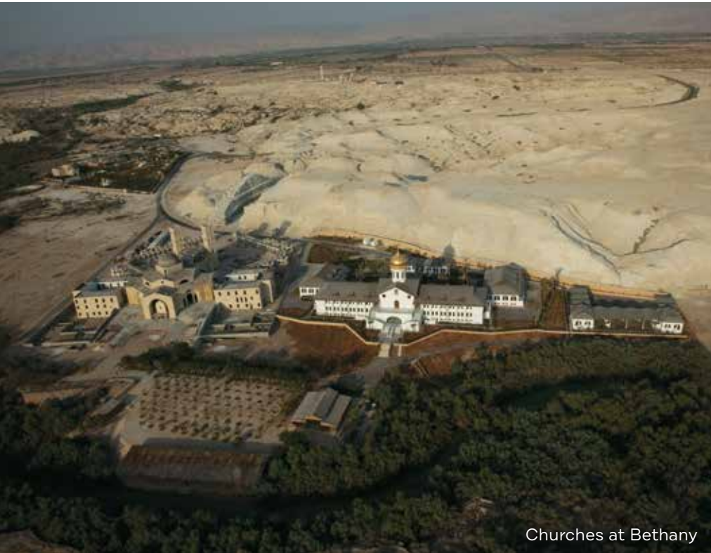
Churches at Bethany

The 3rd century Roman building, decorated with mosaics, is believed to be an early Christian 'Prayer Hall' – probably the earliest building for this specific use to have been identified anywhere in the world.