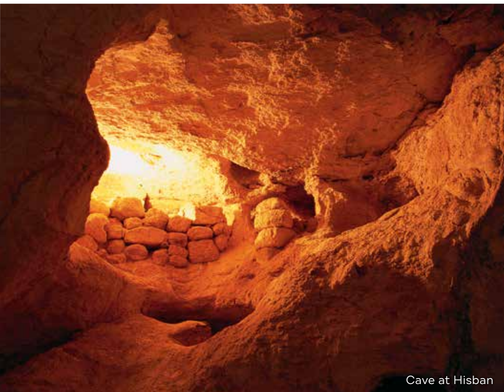
Cave at Hisban