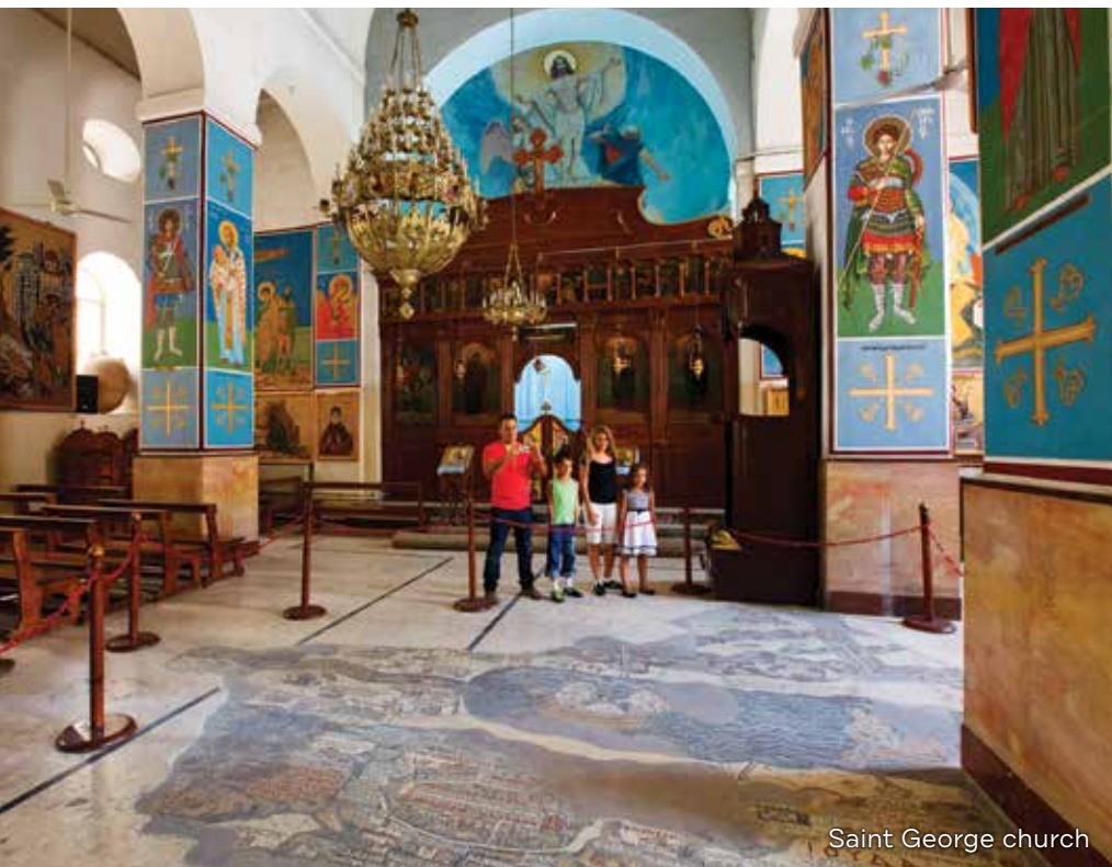
Saint George church

But Madaba's real masterpiece, located in the Orthodox Church of Saint George, is the 6th century AD mosaic map of Jerusalem and the Holy Land – the earliest religious map of the Holy Land in any form to survive from antiquity. Accordingly, Madaba is dubbed “The City of Mosaics”.